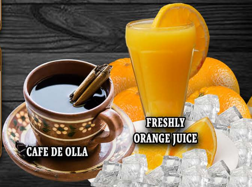
CAFE DE OLLA