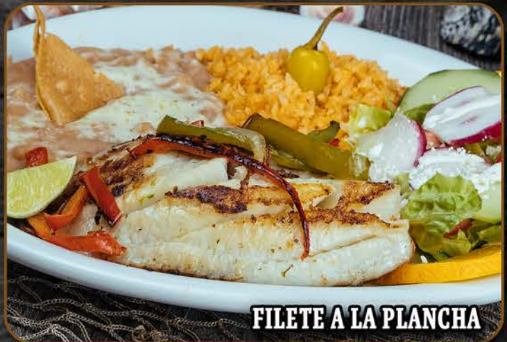
FILETE A LA PLANCHA