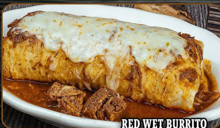
RED WET BURRITO