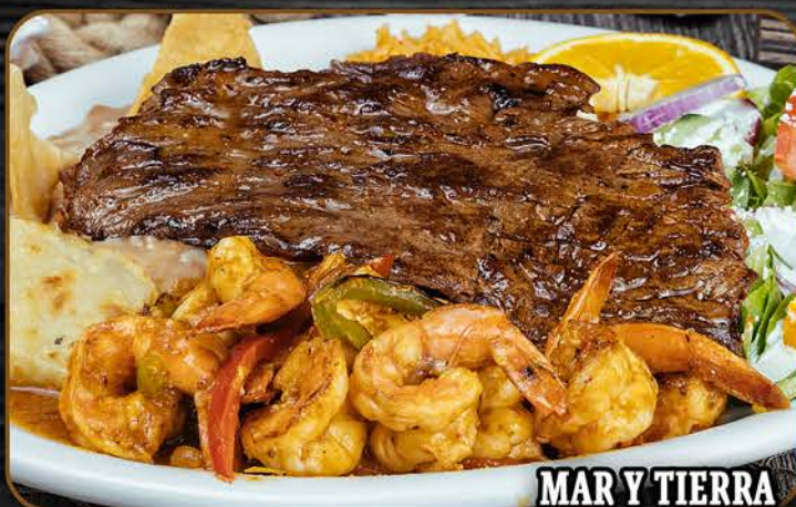
MAR Y TIERRA