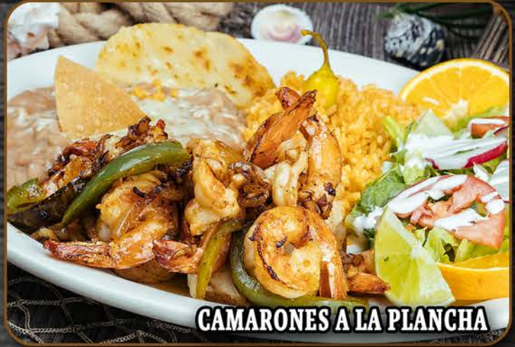
CAMARONES A LA PLANCHA