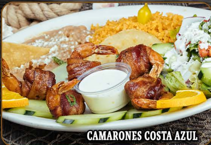
CAMARONES COSTA AZUL

WARNING: Consuming raw or under cooked meats, poultry, seafood, shellfish or eggs may increase your risk of food borne illness, especially if you have certain medical conditions. This item may be served raw or under cooked at your request.