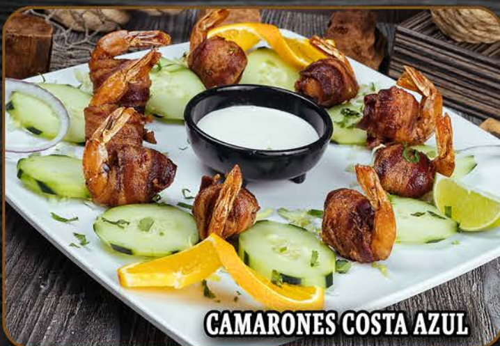
CAMARONES COSTA AZUL