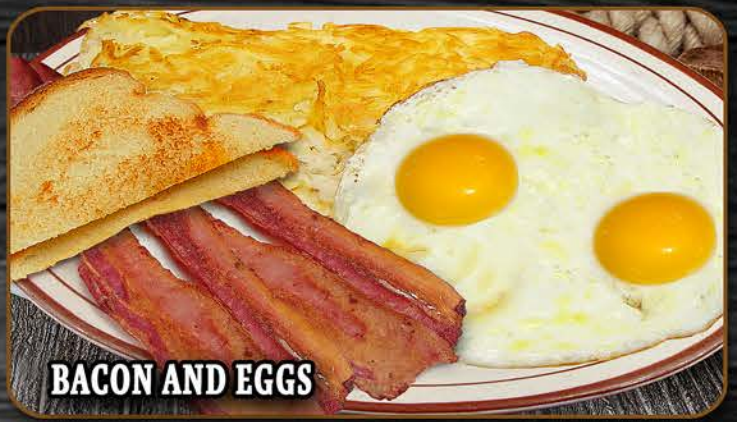
BACON AND EGGS