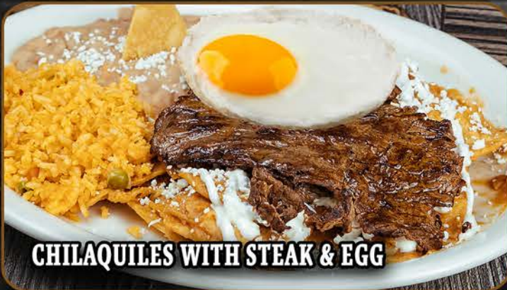
CHILAQUILES WITH STEAK & EGG