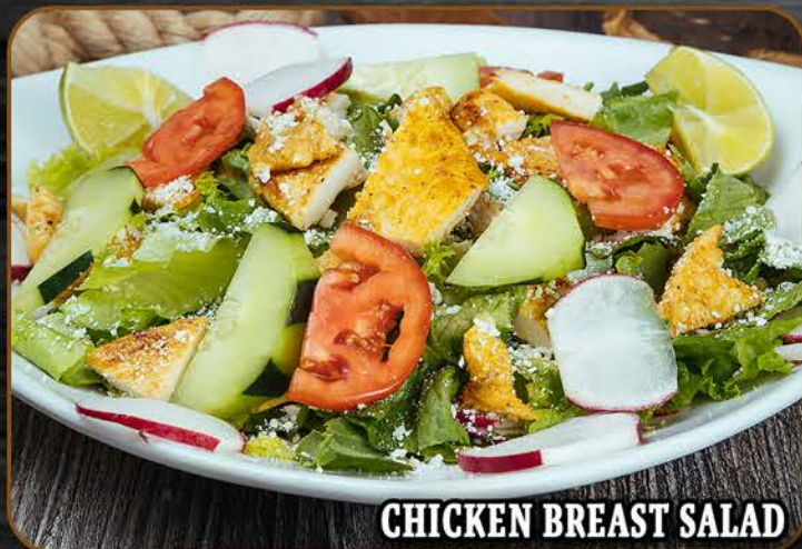
CHICKEN BREAST SALAD