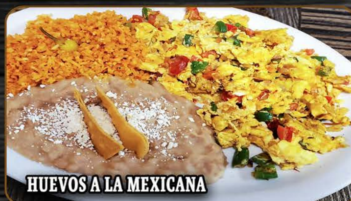
HUEVOS A LA MEXICANA