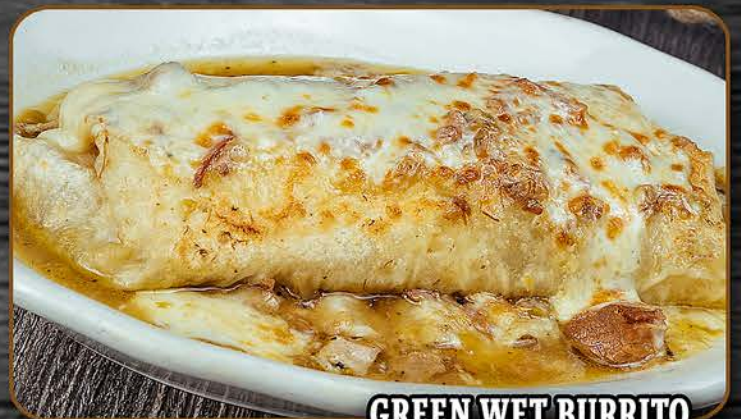
GREEN WET BURRITO