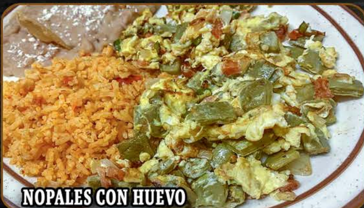
NOPALES CON HUEVO