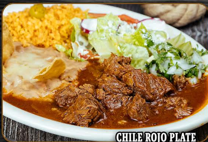
CHILE ROJO PLATE