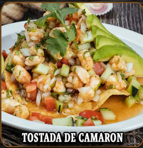
TOSTADA DE CAMARON