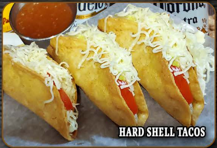
HARD SHELL TACOS

CHICKEN BREAST . . . . . 12.99 Savory seasoned grilled chicken on fresh cut greens with a Maria's house dressing. DINNER SALAD . . . . . 4.99