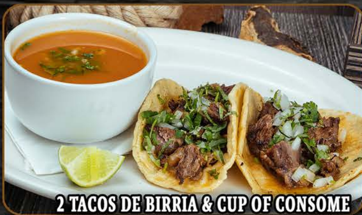
2 TACOS DE BIRRIA & CUP OF CONSOME