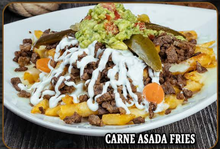
CARNE ASADA FRIES